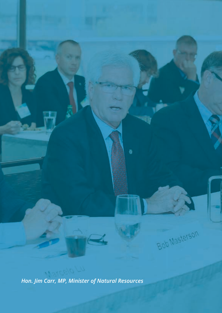
Hon. Jim Carr, MP, Minister of Natural Resources