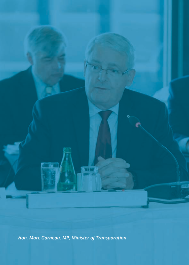
Hon. Marc Garneau, MP, Minister of Transportation