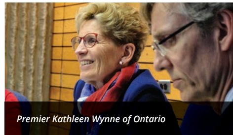
Premier Kathleen Wynne of Ontario

CIAC worked in close partnership with the American Chemistry Council (ACC) and the Asociación Nacional de la Industria Química (ANIQ) to develop and articulate a consensus position on NAFTA modernization. The tripartite statement outlines the chemistry industry's views of the benefits and opportunities for future improvements to NAFTA. Two additional joint statements provided consensus advice on the issues of rules of origin and regulatory cooperation.